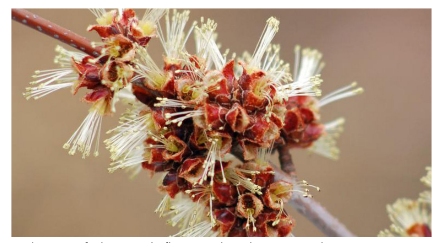
A close up of silver maple flowers.