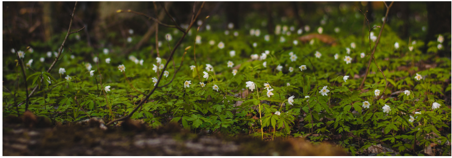
On this forest floor snowdrops are some of the first flowers to come out in the spring.

Winter in Chicago can be long but we've finally noticed some signs of spring while we go on walks in our neighborhoods and are so excited for the change of seasons. This resource has some signs of spring we've spotted recently. The next time you and your family go out for an adventure, see if you can spot any of these clues that warmer weather is coming!