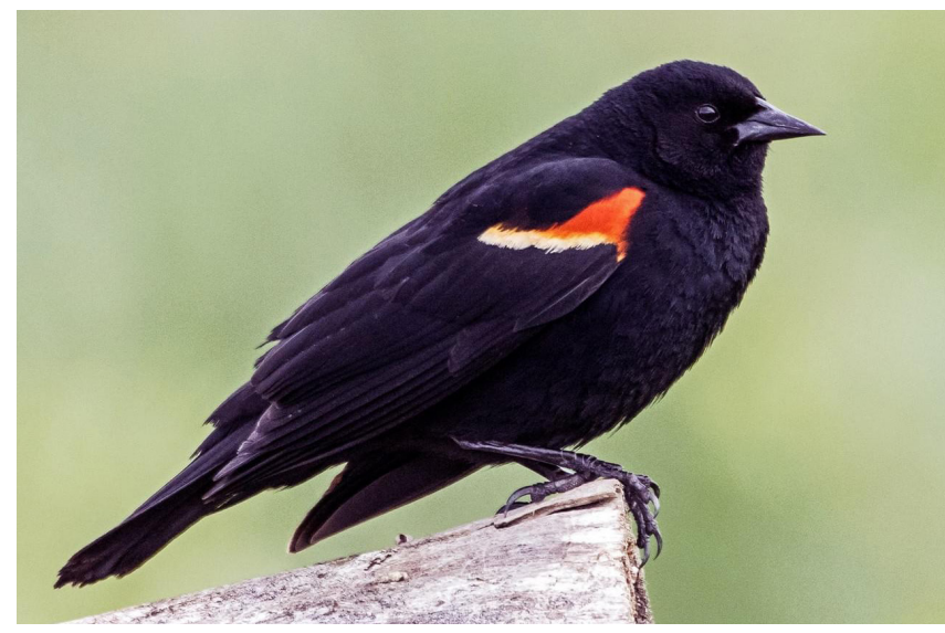
The characteristic red patches on a male's wings make it an easy bird to identify even for novice bird-watchers.