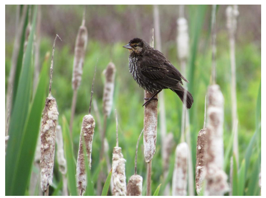
A female red-winged blackbird perching on some cattails.

If you live near a wetland or marshy area, you've definitely seen these birds! The males are all black, except for red and yellow shoulder patches on their wings, and they are very loud and rowdy! Over the winter, most of the city's red-winged blackbirds migrate south, to spend time in the Southern United States or Central America. But recently we've seen them in trees at Humboldt Park! They're back from their winter holiday.